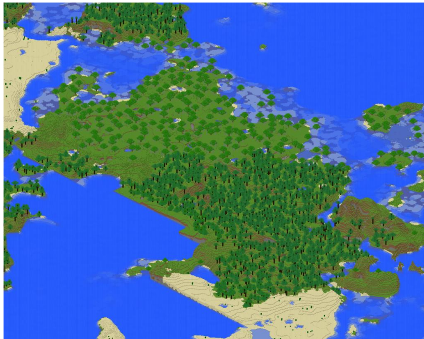
Above: This is an example of a landmass. This is too big for just one person to use and is connected to other islands to. However, it could easily be shared by having one person at the top, and one person at the bottom.