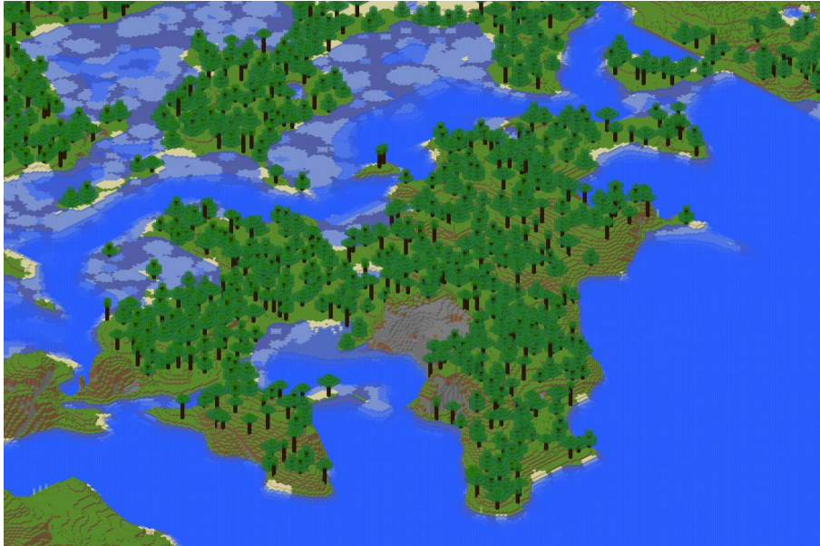
Above: Perfect example of an island suitable for one person to build all of their creations on.

In this section, I will show some examples of the building regulations in action. This map screenshots were taken from our Plugin testing server and as such, are not active infringement of the rules. They are just examples of what is and isn't acceptable in the Digiex Server.